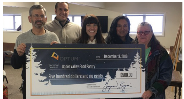
Donation to the Upper Valley Food Pantry in Saint Anthony, ID.