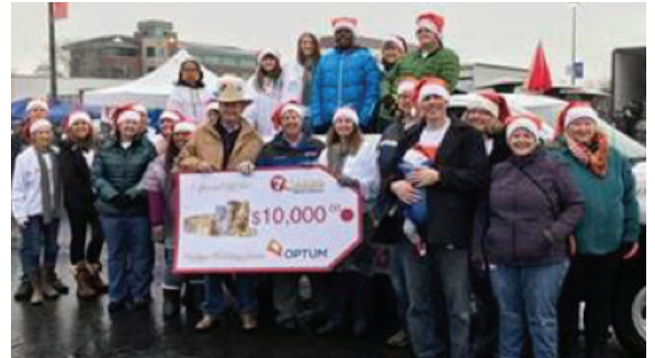
7Cares Idaho Shares day in Boise, Idaho