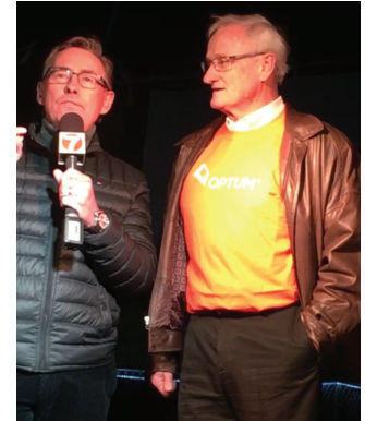
Live broadcast at the Boise Tree Lighting Celebration for 7Cares Idaho Shares