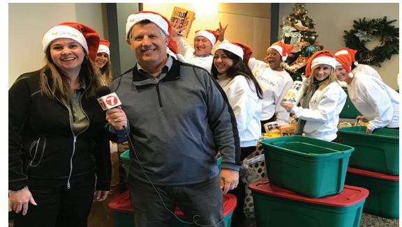
Live Broadcast at the Optum Office for 7Cares Idaho Shares