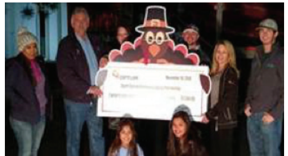
Donation to the S. Central Community Action Partnership