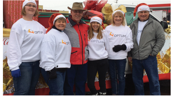
7Cares Idaho Shares day in Twin Falls, Idaho

Optum Idaho employees took an active role in helping make the $22,500 in donations possible. Our efforts were recognized by local media, elected officials and community leaders throughout the state.