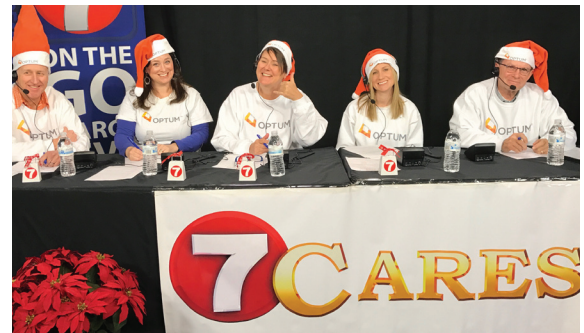
Optum Staff volunteering at the phone bank for 7Cares Idaho Shares